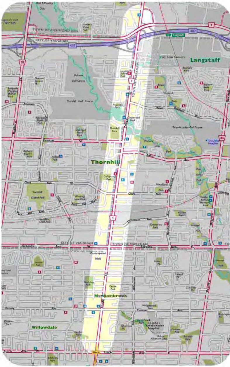
Figure 1: Study Area Map