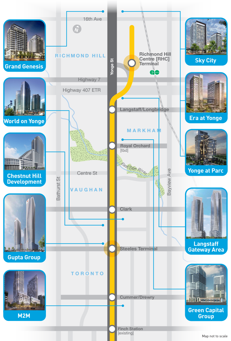
Map not to scale