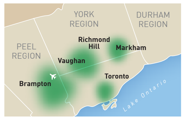
Figure 4 - GTHA Employment Megazones