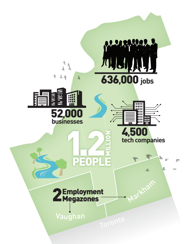
Figure 1 – Growth and employment in York Region.

York Region is Canada's fastest-growing large municipality and one of Ontario's largest business communities [Figure 1], with over 1.2 million residents, 52,000 businesses with over 636,000 jobs,